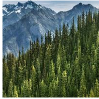
Alberta Blue Hydrogen Net Zero-Carbon

Already committed & being executed to come on-stream before 2027