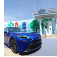
Pattaya H2 for Mobility