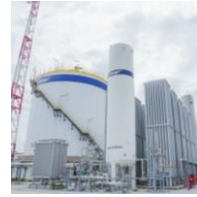
Rayong Low Carbon Air Separation