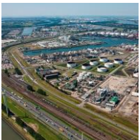
Rotterdam Europe's Largest Blue Hydrogen Plant