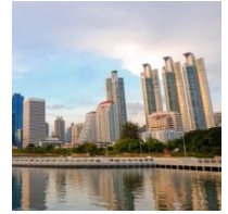
Benchakitti Park Sustainable Water Treatment