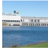
New York Carbon-Free Liquid Hydrogen