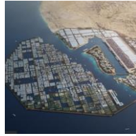
Neom Green Hydrogen Zero-Carbon