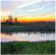
Louisiana Blue Hydrogen Low-Carbon